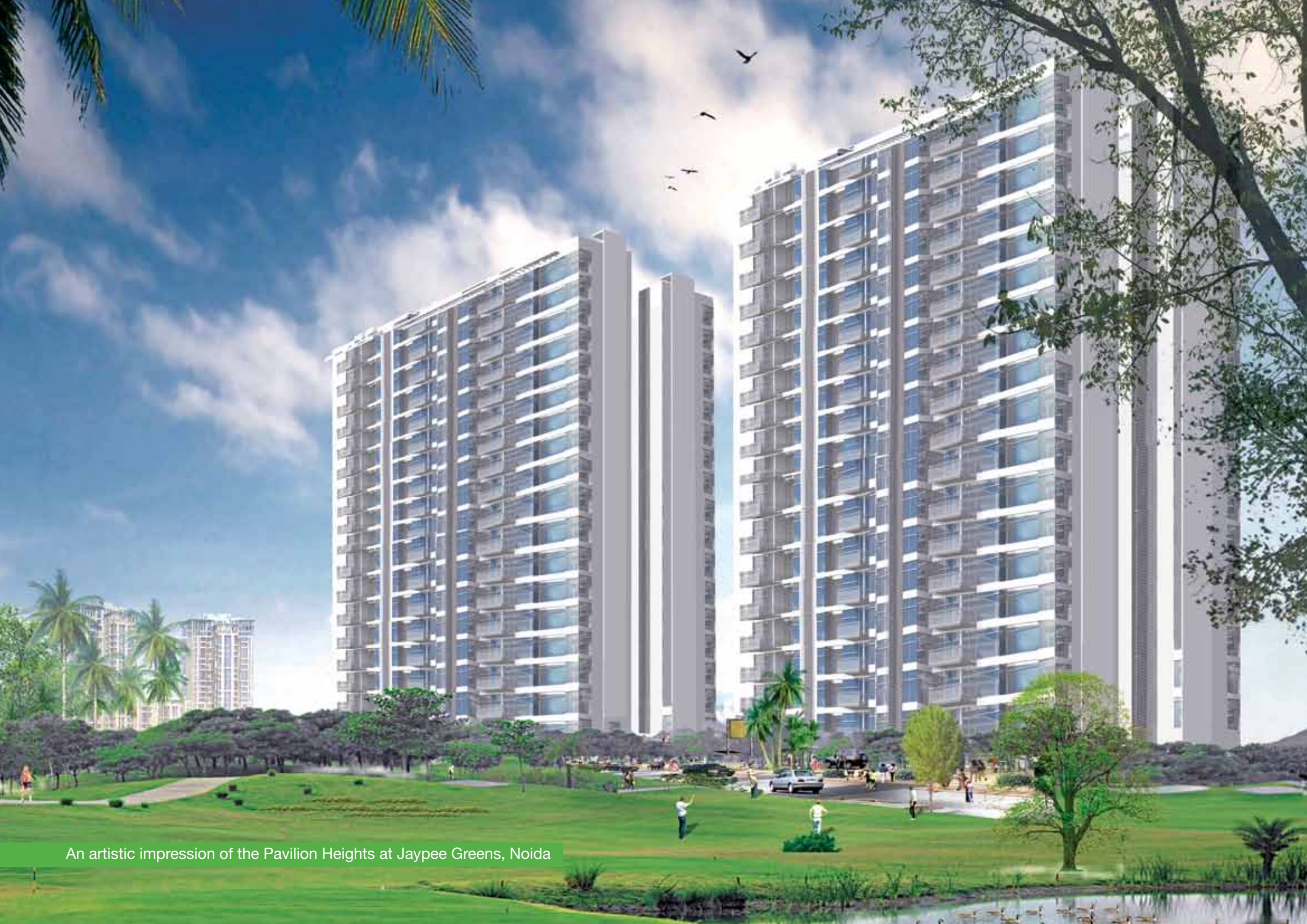
An artistic impression of the Pavilion Heights at Jaypee Greens, Noida