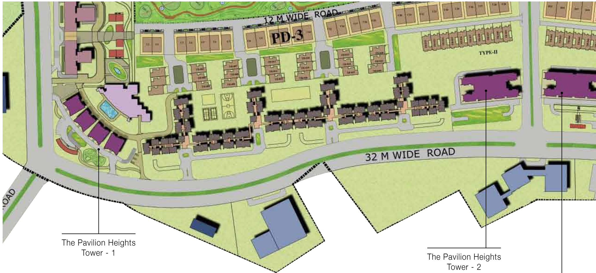
The Pavilion Heights Tower - 1