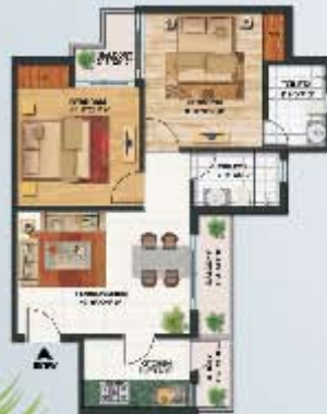
UNIT TYPE - A (2BHK + 2 TOILETS + UTILITY) SUPER AREA = 966 SQ. FT.