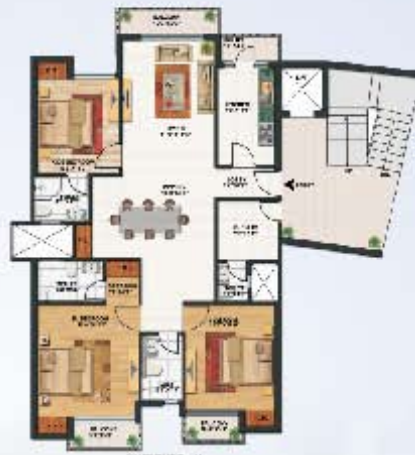
UNIT TYPE - K (4 th FLOOR) SUPER BUILT UP AREA = 1930 SQ. FT. TERRACE AREA = 588 SQ. FT.