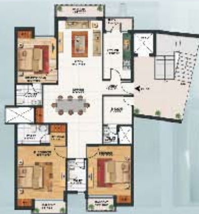
UNIT TYPE - J (1 st & 3 rd FLOOR) SUPER BUILT UP AREA = 1930 SQ. FT.