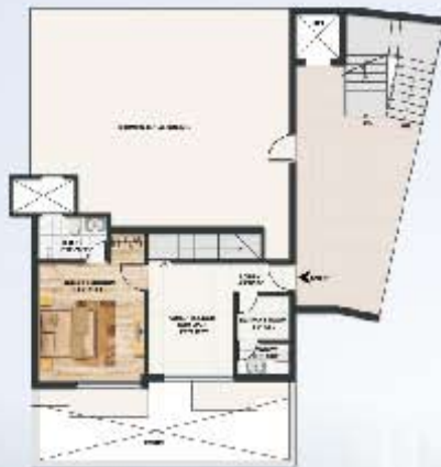
UNIT TYPE - H (3GF) SUPER BUILT UP AREA = 2858 SQ. FT.