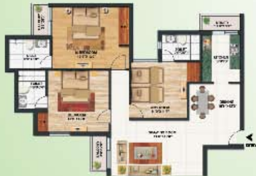
UNIT TYPE - F 3BHK SIMPLEX UNIT SUPER AREA = 1993 SQ. FT.