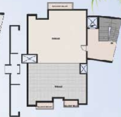
UNIT TYPE - J & K (TERRACE FLOOR)