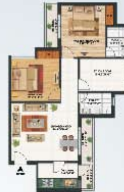
UNIT TYPE - B (2BHK + 2 TOILETS + STUDY + UTILITY) SUPER AREA = 1195 SQ. FT.