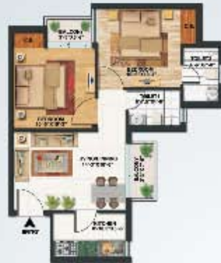
UNIT TYPE - AL (2BHK + 2 TOILETS + UTILITY) SUPER AREA = 825 SQ. FT.