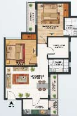
UNIT TYPE - BL (2BHK + 2 TOILETS + STUDY + UTILITY) SUPER AREA = 1070 SQ. FT.