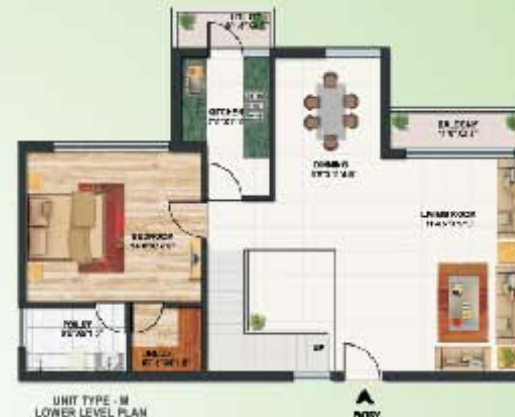
UNIT TYPE - M LOWER LEVEL PLAN 4BHK DUPLEX UNIT SUPER AREA = 3493 SQ. FT.