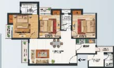
UNIT TYPE - C (3BHK + 3 TOILETS + SERVAANT ROOM + UTILITY) SUPER AREA = 1365 SQ. FT.