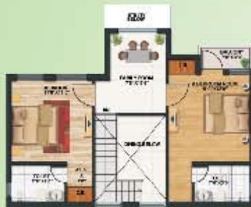
UNIT TYPE - G UPPER LEVEL PLAN 3BHK DUPLEX UNIT SUPER AREA = 1725 SQ. FT.