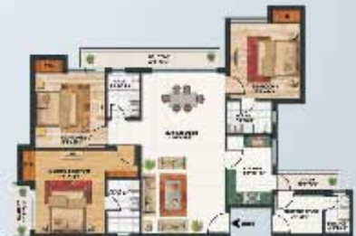
UNIT TYPE - E (3BHK + 4 TOILETS + SERVAANT ROOM + UTILITY) SUPER AREA = 1685 SQ. FT.