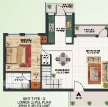
UNIT TYPE - G LOWER LEVEL PLAN 3BHK DUPLEX UNIT SUPER AREA = 1725 SQ. FT.