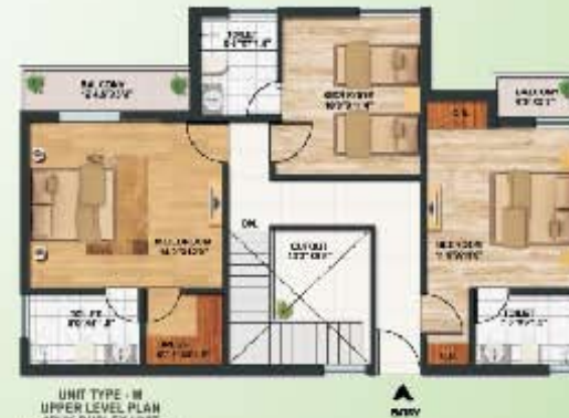
UNIT TYPE - M UPPER LEVEL PLAN 4BHK DUPLEX UNIT SUPER AREA = 3493 SQ. FT.