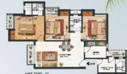
UNIT TYPE - CL (3BHK + 3 TOILETS + SERVAANT ROOM + UTILITY) SUPER AREA = 1295 SQ. FT.