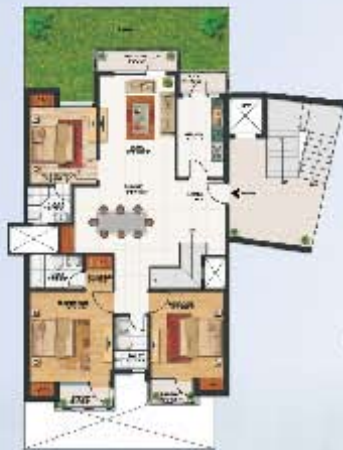
UNIT TYPE - H (UGF) SUPER BUILT UP AREA = 2393 SQ. FT. LAWN AREA = 285 SQ. FT.