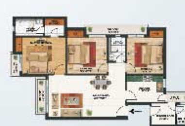
UNIT TYPE - D (3BHK + 3 TOILETS + SERVAANT ROOM + UTILITY) SUPER AREA = 1592 SQ. FT.