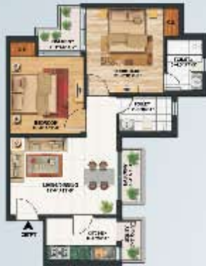
UNIT TYPE - A1 (2BHK + 2 TOILETS) SUPER AREA = 825 SQ. FT.